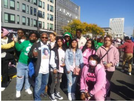
2022 Breast Cancer Walk-Newark