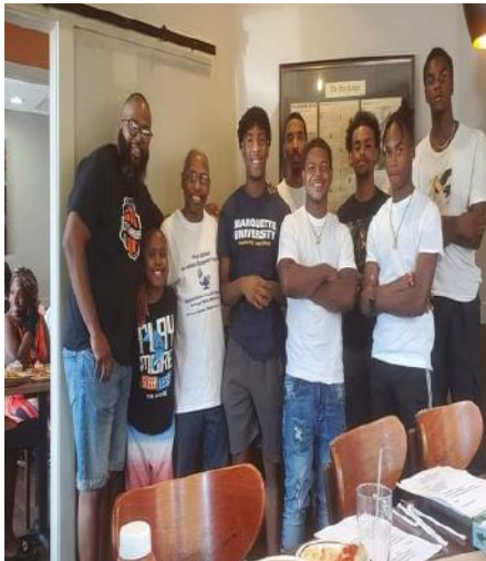
Class of 2023 Orientation Breakfast-7/4/2022