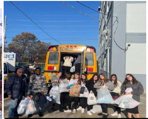
Clothing & Coat Distribution Newark Homeless Shelter-11/22/2022