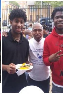
Back to School Bookbag Giveaway/Cookout