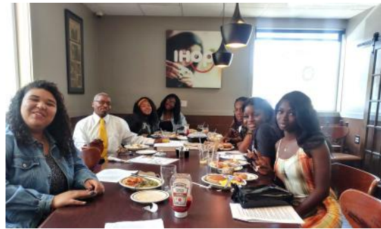
Class of 2022 Graduates Breakfast